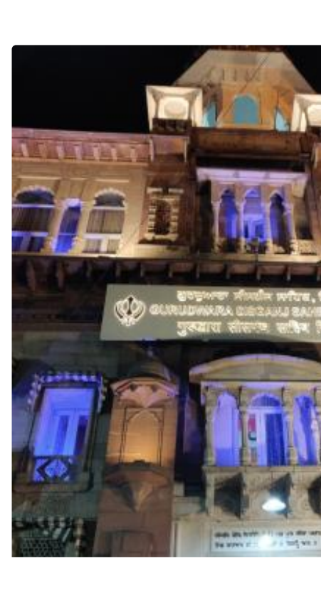
A Trail to the Historic Sisga and Sunehri Masjid

Uncover the Past Kid Friendly, Pet-Friendly, Photography